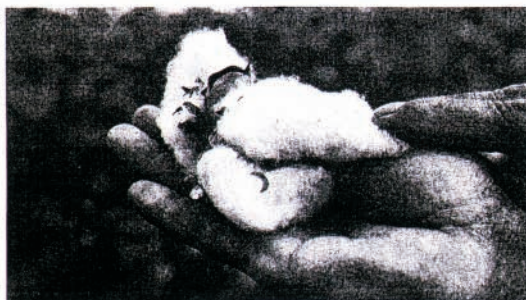
"India erred by not clamping down on long-duration crops when Bt cotton was first introduced." Pink bollworm attack Bt cotton fields in Anantapur, Andhra Pradesh. • K. MURALI KUMAR

Cotton researchers broadly agree on the reason: the pink bollworm grew resistant because India restricted itself to cultivating long-duration hybrids since the introduction of Bt cotton in 2002. Hybrids are crosses between two crops that often see higher yields than their parents, in a genetic phenomenon called hetero-